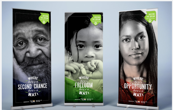
Retractable vertical banners are easy to showcase in your workplace.