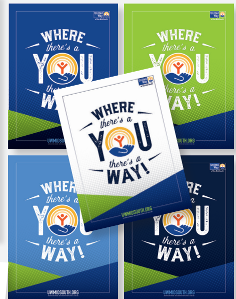
Posters, brochures, booklets and flyers.